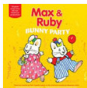
Max & Ruby Bunny Party